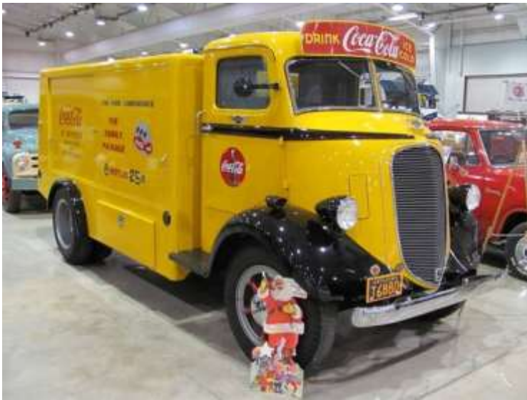
A matching pair top left, interesting suspension adaption above, Coca-Cola always had pretty transport left and below a delivery which many of us would like now.