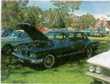
1 st Modified Entrant No. 20, Scot & Kesanya Baker