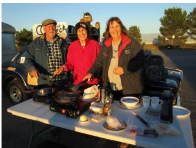
The happy crew having breakfast left and the large line up of vehicles for the run.