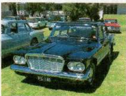
Sponsors Choice Entrant No. 63, Cliff Smith